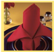
TABLE LINENS, NAPKINS AND SKIRTING