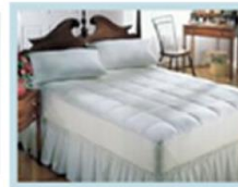
MATRESS TOPPERS AND QUILTED PADS