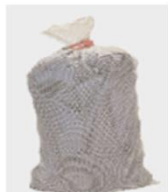
LAUNDRY BAGS AND HOUSEKEEPING SUPPLIES