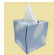
COMPLETE PAPER PRODUCTS