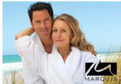
BATH ROBES & SLIPPERS TERRY, VELOUR AND WAFFLE WEAVE