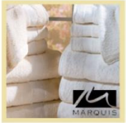
LUXURY BATH TERRY