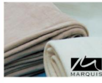
SERENITY FLEECE BLANKETS