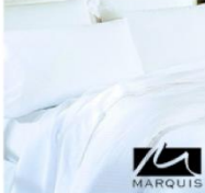
ALL THREAD COUNT SHEETS