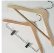
HANGERS AND ACCESSORIES